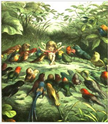
A singing-lesson, from Princess Nobody , a tale by Andrew Lang illustrated by Richard Doyle in 1884.

|36=[[File:PrincessNobody-13.png|thumb|upright 1|center|A singing-lesson, from ''Princess Nobody'', a tale by [[Andrew Lang]] illustrated by [[Richard Doyle]] in 1884.]]